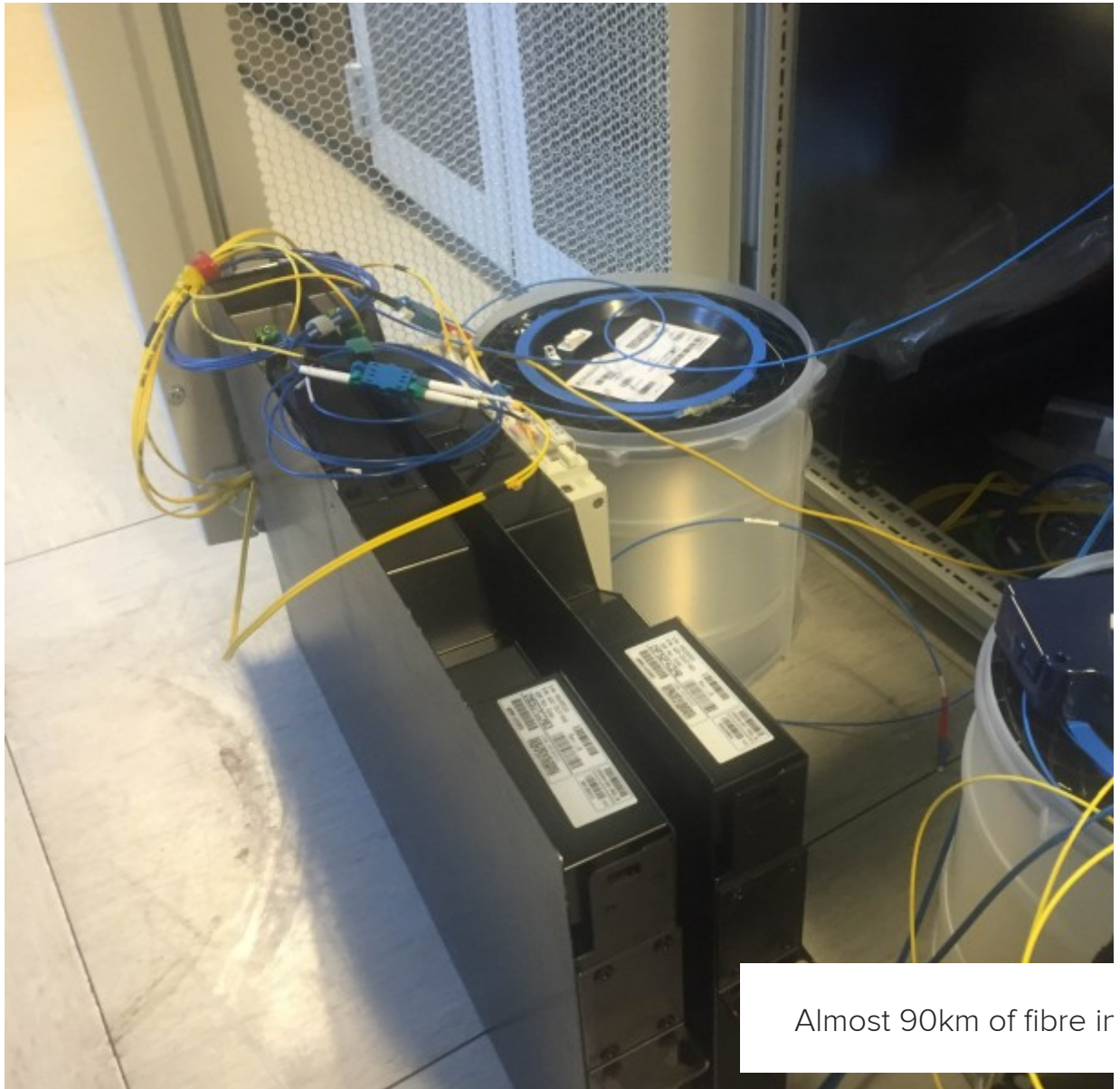
Almost 90km of fibre in

equipment) These two are connected together through the Coherent 100Gbps interfaces which we have put about 90km of fibres inbetween to simulate what a real network-stretch could look like in the real network. In the routers we also have multiple 100Gbps Ethernet cards and 10x10Gbps cards and these we have connected a packet-cannon (EXFO FTB-500 1x100G) that make sure that the routers is constantly being feed with 100Gbps of traffic coming in on the client-ports.